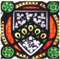
Heraldry & Brass Rubbing