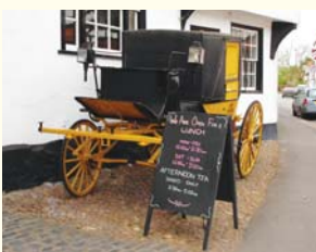
Local History Links Dorchester Museum