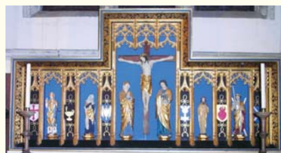
Signs, Symbols & Spirituality - Tudor Times