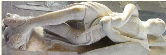
Knights and Normans - Maths Trails