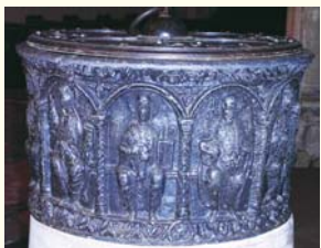
Heroes & Villains