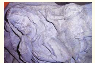
Medieval Life & Monasticism